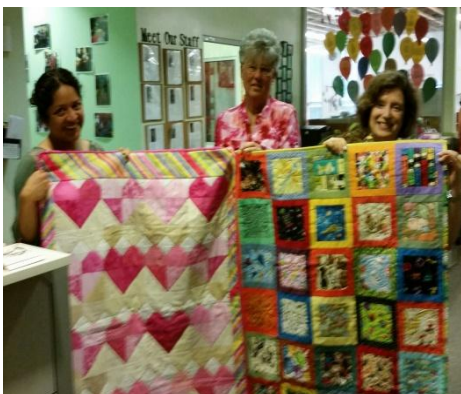
June 2016 – St. Joseph's Center, Venice, California

Thank you for making this past year such a success and the focus for this next year will be presented at the General meeting in August. If you are working on quilts – or have completed quilts – please continue and bring completed quilts to the next meeting. We will definitely make sure they are delivered to the appropriate group.